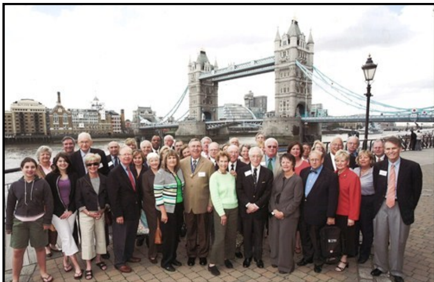
The American Gynecological Club at the Tower Bridge in London, 2007