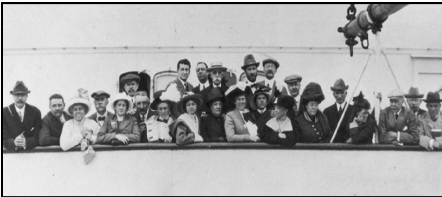
The American Gynecological Club embarks on its first European trip in 1912 aboard the S.S. Rotterdam.