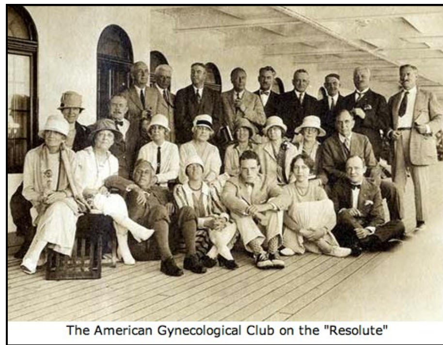
The American Gynecological Club on the "Resolute"